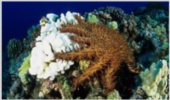
Devastating invasion: Crown-of-thorns starfish are