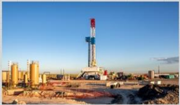
Hydraulic fracturing: Fracking is not a one-size-fits-